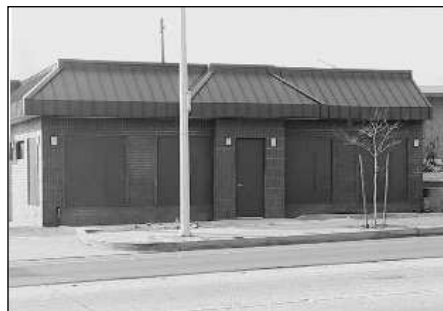
Planned Parenthood facility in Monrovia, Calif.