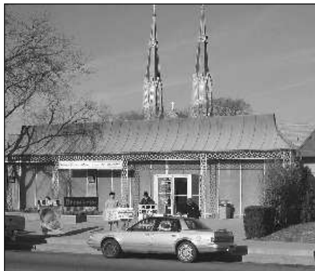
Peoria PP clinic with St. Mary's Cathedral behind it.